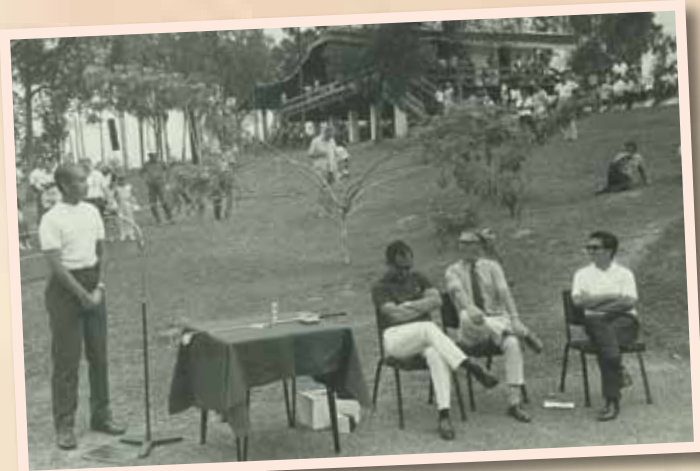
The late Chief Justice, Wee Chong Jin addressing members on the occasion of the New Course Opening on 23 August 1970

In the 1980s, new clubs like Sentosa, Jurong and Tanah Merah and even established clubs like Warren and Keppel introduced transferable memberships which commanded between $25,000 and $75,000 on the open market. Some